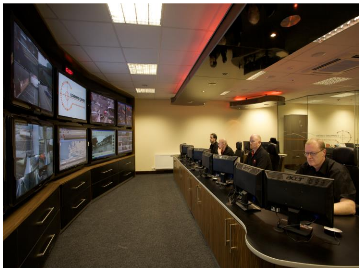
Alarm, CCTV, gate and environmental monitoring services provided by our Command and Control Centre.